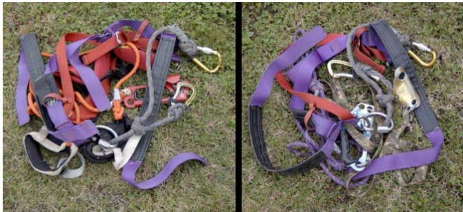
Fig 5: For “gearing up” tests, systems were placed in a random pile similar to ones left at the bottom of a last pitch. The Mitchell System is at left and the Frog at right. Although the Mitchell System is not sit harness dependent, the same type harness was used for all tests. Cowtails were included for both systems.

between drops. This may or may not be a serious concern in practical caving for several reasons. Actual “gearing up” time (putting on vertical gear) only matters for the first caver to ascend. In addition, once the Mitchell system is on the caver, the “clip in” time for the Mitchell is actually faster than the Frog (see tests results below). Unless the caver is pushing on alone, “gearing down” time usually coincides with waiting for the next caver to descend. Overall rope occupation time (including all mid-rope obstacles) is far more important than any single aspect of a system when vertical effectiveness is the criteria. Time lost at “clip in” may be regained by climbing with a more effective system. Total energy expenditure of the climber should also be considered.