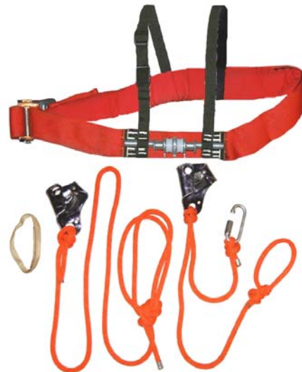
Fig 3b: This Mitchell has been reduced to minimum weight (1200 g) and bulk without reducing climbing efficiency. It uses 8 mm rope instead of sewn foot loops, a Flash Bar roller box and two Petzl Basics. The tan webbing (left) is the “chicken loop” loop for the upper ascender. The other ascender uses a sit-harness tether instead of a chicken loop.