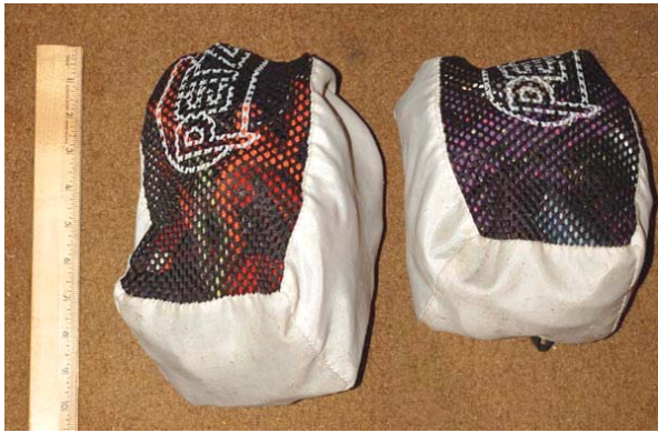
Fig 3a: The left bag (above) contains the complete expedition-style Mitchell System shown at right. The right bag contains my normal Frog System as shown above (no sit-harness, no Pantin). The Mitchell bag measures approx. 25 x 18 x 10 cm. (10 x 7 x 4 in). The Frog bag measures approximately 20 x 16 x 10 cm (8 x 6 x 4 in).