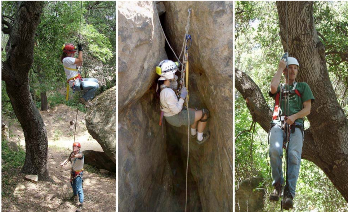
Fig 4: A Frogger on our outdoor treadmill (left). Negotiating one of the practice rebelays (center) and a first-time Mitchell user on the treadmill (right). The treadmill was also used for knot crossings and deviation crossings.

Rebelay conclusions: The Frog is certainly faster than the Mitchell on the rebelay itself. When measured as part of the practical, overall vertical progress however, the difference is slight. Unless there are numerous rebelays or the pitch is short (less than 10 meters), the faster climbing times of the Mitchell outweigh the time lost at any single rebelay.