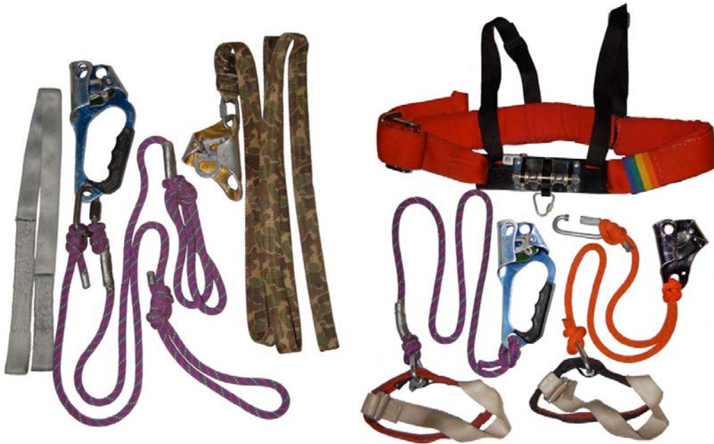
Fig 2: My personal system components. Frog at left and the Mitchell system used for testing at right. Weight and bulk measurements did NOT include the sit harness and cowtails for either system. A dedicated safety tether (gray webbing) was included for the Frog. These systems are built to my specifications and both systems can be further minimized in both weight and bulk.

The goal of my testing was to determine how much these advantages or disadvantages actually affect the OVERALL vertical experience for both the individual AND the group. The main question is: Is one system definitively superior in terms of vertical effectiveness in real-world Alpine SRT situations?