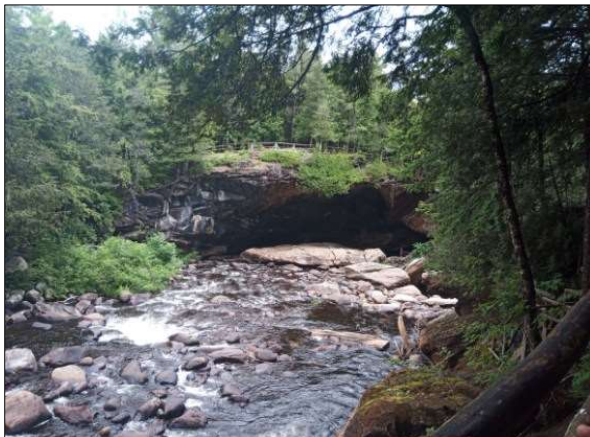
A cave entrance with a stream coming out of it in the Adirondacks. Photo by Mitch Berger

Don't forget to wear your yellow “Lifetime Caver” t-shirt (courtesy of Speleobooks) to the Howdy Party. Meet on the bleacher at 7:30 for a group photo.